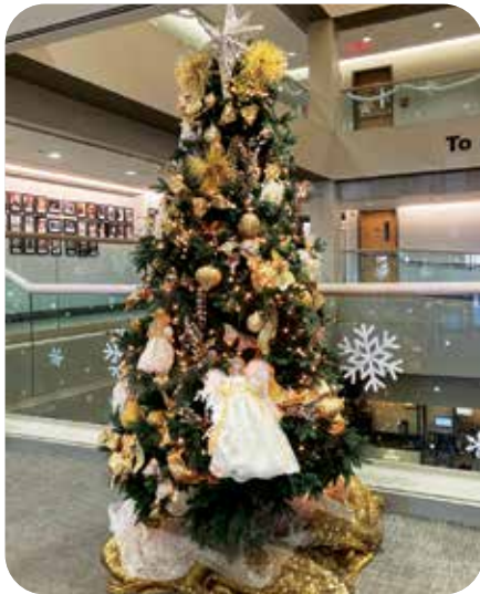
The 2024 Tree of Angels graced the lobby of the Faculty Medical Offices building during the holiday season. Donations to this fund support the mission of the Little White House.