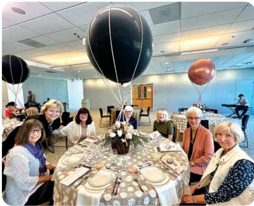
Some of the LWH volunteers enjoying the luncheon