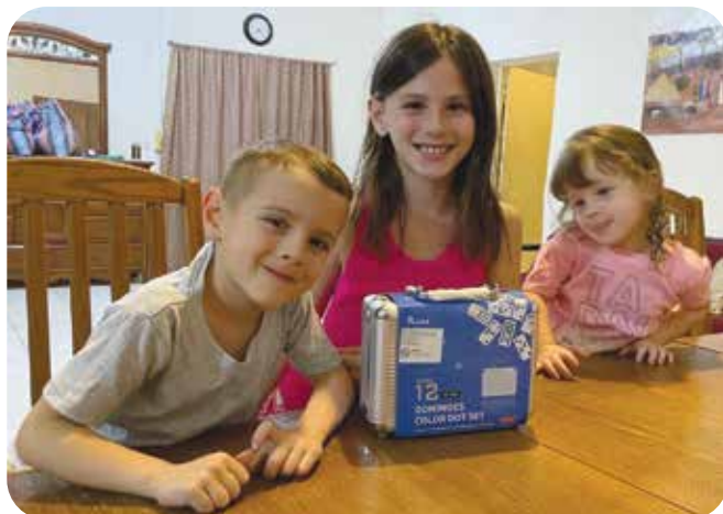
The Waterbrook children in Chad after receiving dominoes in their Auxiliary mission box