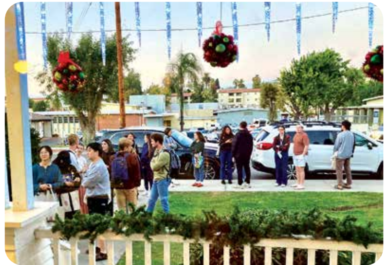
Students line up for the Christmas tree drawing and opening of the Little White House Christmas Boutique. (See page 6 for more photos.)

The mission of the Loma Linda University Medical Auxiliary is to demonstrate God's love through benevolence and shared service. The Auxiliary promotes the mission work of its Alumni; the education and welfare of medical students, residents and their spouses; and the intellectual and spiritual growth of its diverse membership.