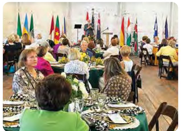
Luncheon in the Grigsby Building