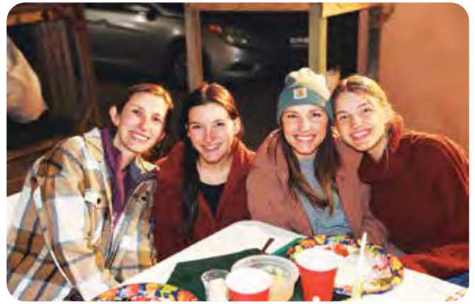
JMA celebrating Friendsgiving