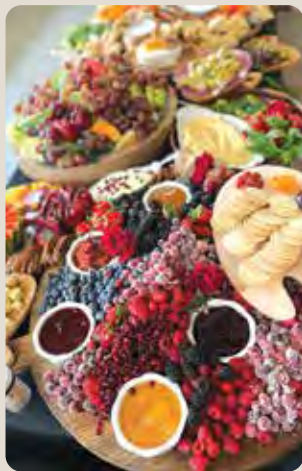
A festive palette of fruit, veggies, cheese and sweet treats was the centerpiece for a room full of Christmas shopping delights.