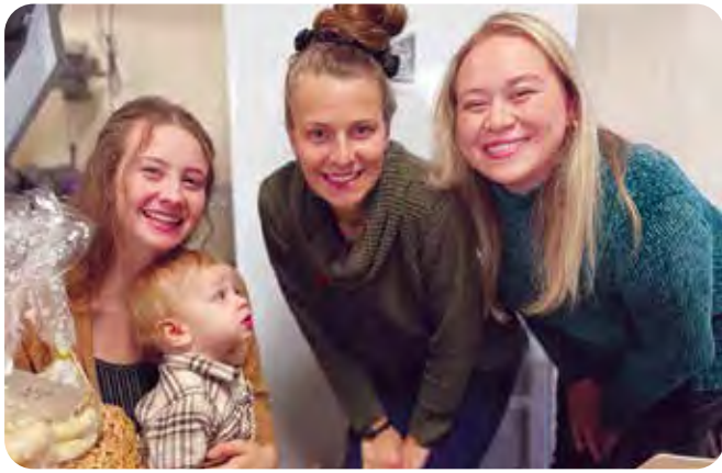
JMA bake sale at the Christmas Boutique