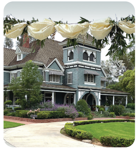
Raeburn Place was a lovely venue.

We look forward to an equally blessed time at the APC Homecoming Luncheon on Sunday March 5, 2023. Mark your calendars!