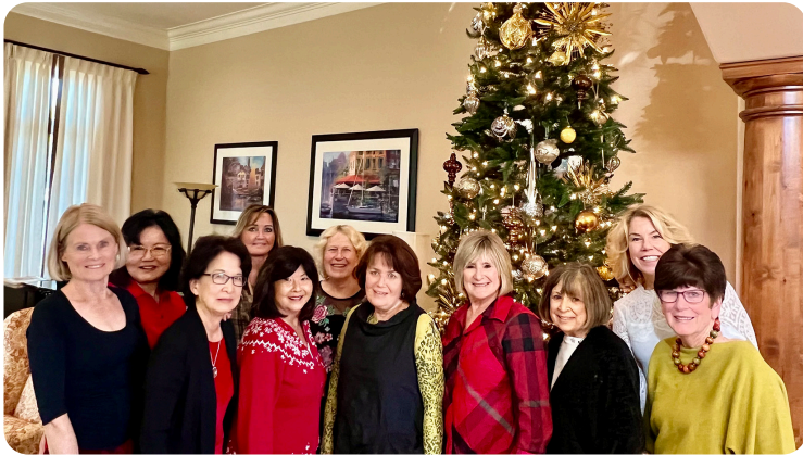
Auxiliary Board Christmas Party