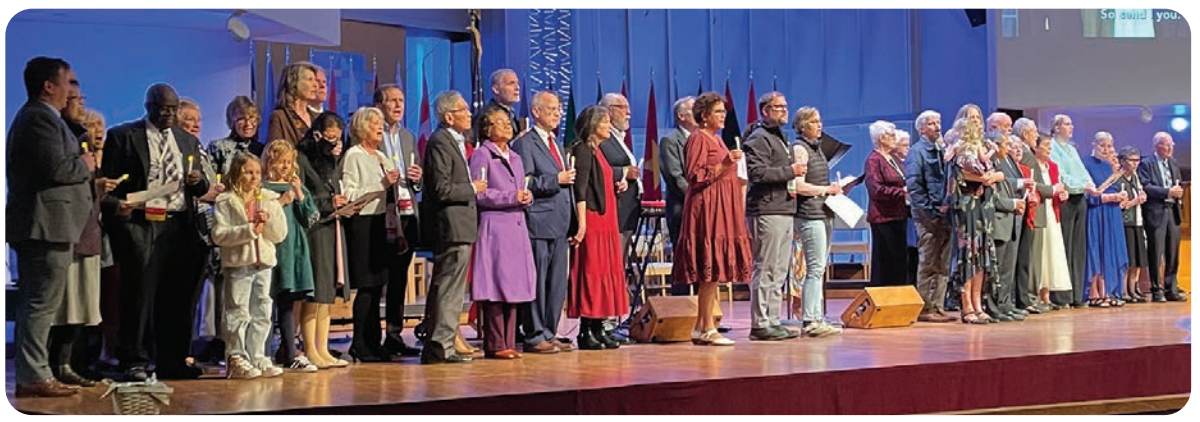
Singing "So Send I You"