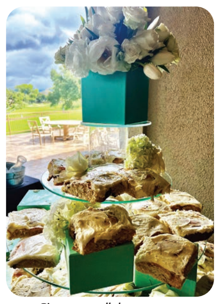
Cinnamon roll dessert tower