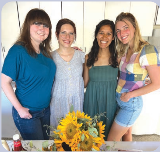
JMA 2025-26 Officers:

Looking ahead, we are excited to continue offering these family-friendly events, twice-monthly park days with coffee, and more! Our hope with these events is to give families a chance to relax, connect, and build lasting friendships. RMA is here to walk alongside you during this season of life, reminding you that you're not alone.