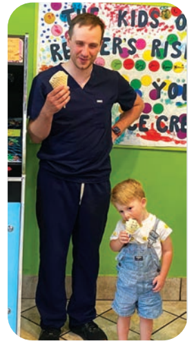
End of the Year Ice Cream Night at Nicho's on June 17