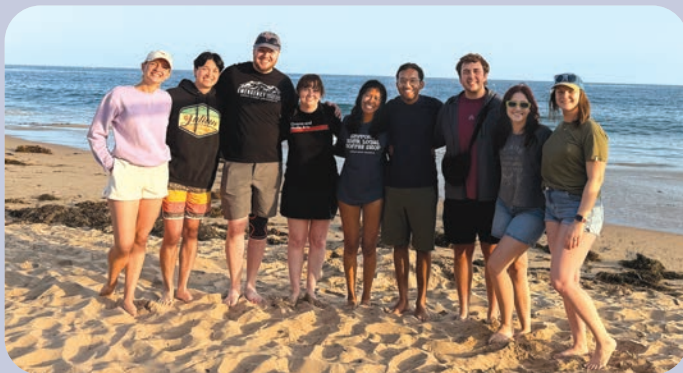
JMA members at Corona Del Mar