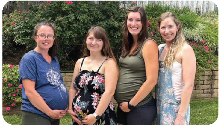
"The RMA Is Growing!" 2025-26 Officers: